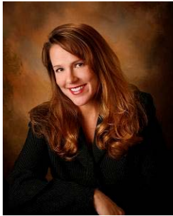
Leslie Biskner Cooperative Business Services Central Ohio $7,023,300 5 loans