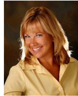
Debbie Scheetz Cooperative Business Services Southwest Ohio $6,566,030 14 loans