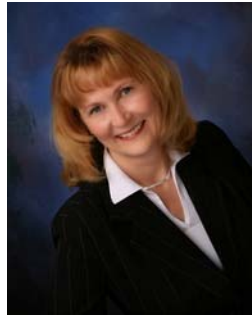
Lorain Cooper Cooperative Business Services Southwest Ohio $7,695,600 16 loans